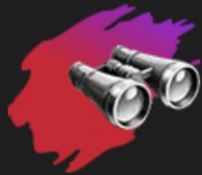
Cyber Threat Exposure

Intel 471 solutions leverage a combination of human-driven research and intelligence and automated intelligence collection to provide comprehensive coverage of the threat landscape, tracking threat actors, hunting them and the threats that are produced.