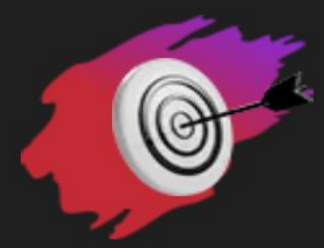
Cyber Threat Hunting