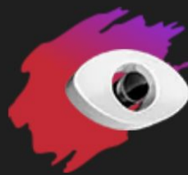
Cyber Threat Intelligence